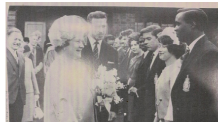
When being presented at the NIPH to the Queen Mother in 1962

both were NIPH Students in 1961/62 and both gained CDP and NDP Qualifications