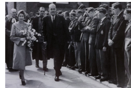
The visit of H.R.H Princess Elizabeth on the occasion of the College’s Golden Jubilee and the opening of Jubilee hostel on 8th June 1951

To mark the loss of Her Majesty The Queen and the ascension of His Majesty King Charles III this year, we thought we’d share a few pictures of the many royal visits to Harper Adams over the years.