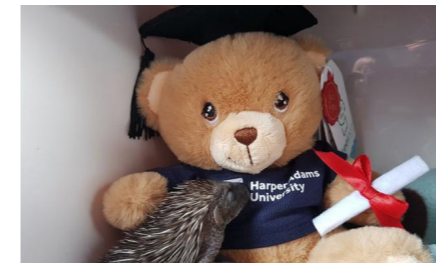
Harper the Hedgehog with a graduation memento from his namesake University