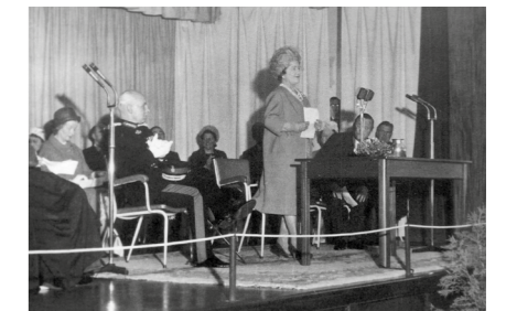
H.R.H Queen Elizabeth, the Queen Mother on the occasion of opening of Queen Mother Hall, 1st May 1963