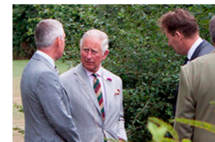
His Royal Highness The Prince of Wales made a flying visit to the Harper Adams University campus, July 2018