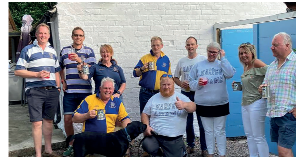
Representatives from HAAC

Live music provided by Sneaky Feelin', a rock and indie covers